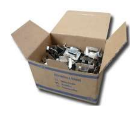
AL JABAL can emboss your brand or LOGO onto the buckles as per your requirements