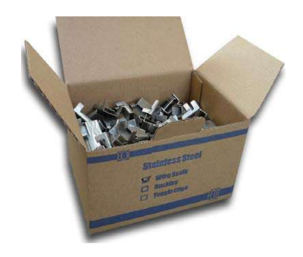
AL JABAL can emboss your brand or LOGO onto the buckles as per your requirements