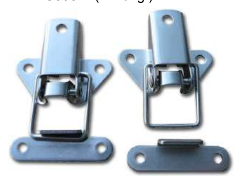
MC806-B ( 4" long )