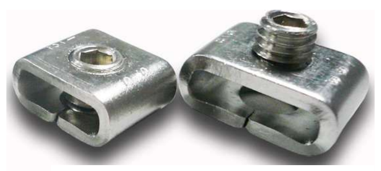
Specifications of screw buckles:

Stainless Steel Screw Buckles are manufactured from high quality type201, type304, type316 stainless steel, used in the clamping works where vibration is not allowed in the installing process caused by tools. And one of its properties is that it can be re-used