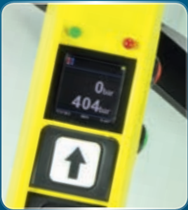
Benefits for wind power: Operating time meters and operational parameters at any given time can be inspected on the remote control display when working with the tensioner