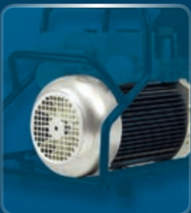
Overheating protection thanks to a high-speed cooling system and specialised oil-immersed motor technology