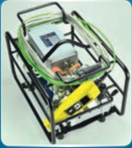
Compact design With mechanism for winding cable